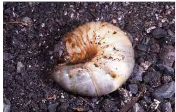
Common Rhinoceros Beetle larva.

The adult beetle stage of Xylotrupes feeds on the soft bark of young shoots of many trees, a favourite being the Poinciana trees gracing so many of Queensland's gardens and streets. Sometimes a particular Poinciana tree will become especially attractive to the beetles and large groups of them may be seen festooning its young branches. Minor damage may be caused by the feeding beetles, but it is rare for any permanent damage to occur. It is thought that these gatherings are part of the beetles' mating behaviour.