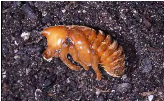
Common Rhinoceros Beetle pupa.

As with all beetles, the rhinoceros beetle larvae (grubs) hatch from eggs and develop into pupae, and these eventually emerge as adult beetles. Each female lays about 50 white eggs in decaying vegetable matter and these take about three weeks to hatch. The larvae feed on decomposing vegetable material and are valuable in accelerating its break-down into compost. In New Guinea the larvae reach maturity in about eight months, but in southern Queensland, it is thought that they require two years of growth before reaching full size. The larvae of Xylotrupes are easily recognised by their translucent grey colour, fine reddish down, dark brown head and enormous size - almost filling the palm of a hand. The larvae are most commonly encountered when digging up old compost heaps or tending a well-mulched garden. In the bush, they are abundant in Australian Brush-turkey ( Alectura lathamii ) mounds.