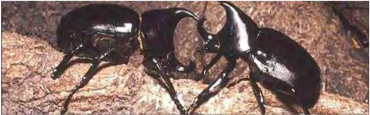
Male Common Rhinoceros Beetles in combat.