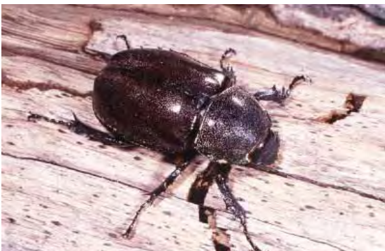
Female Common Rhinoceros Beetle.

One of the most spectacular beetles in Australia is the Rhinoceros Beetle ( Xylotrupes ulysses ). It occurs from South East Asia through the islands of Indonesia to the Solomons and Australia. It is often found in Queensland's coastal towns, including Brisbane. This black beetle reaches 60 mm in length and the male is easily recognised by its large horns; one on the top of the head and the other projecting forward from the middle of the thorax. Each horn is slightly forked at the end. The two horns almost meet, and by moving its head, the beetle can pinch weakly with them.